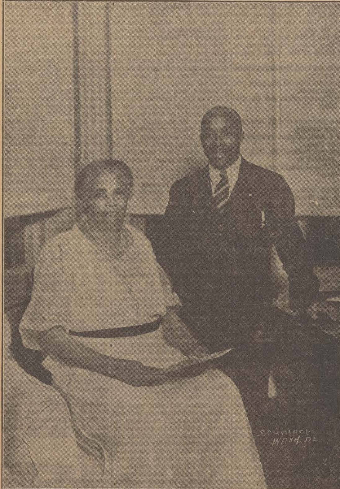
Mother and Father Divine! It Is Wonderful!

you have found. If it were from, and for an Organizational purpose, they desire it. They desire their believers, co-workers and friends to have FAITH in them, as you have FAITH in ME. ("Yes, they do Father," came the reply from the people.)