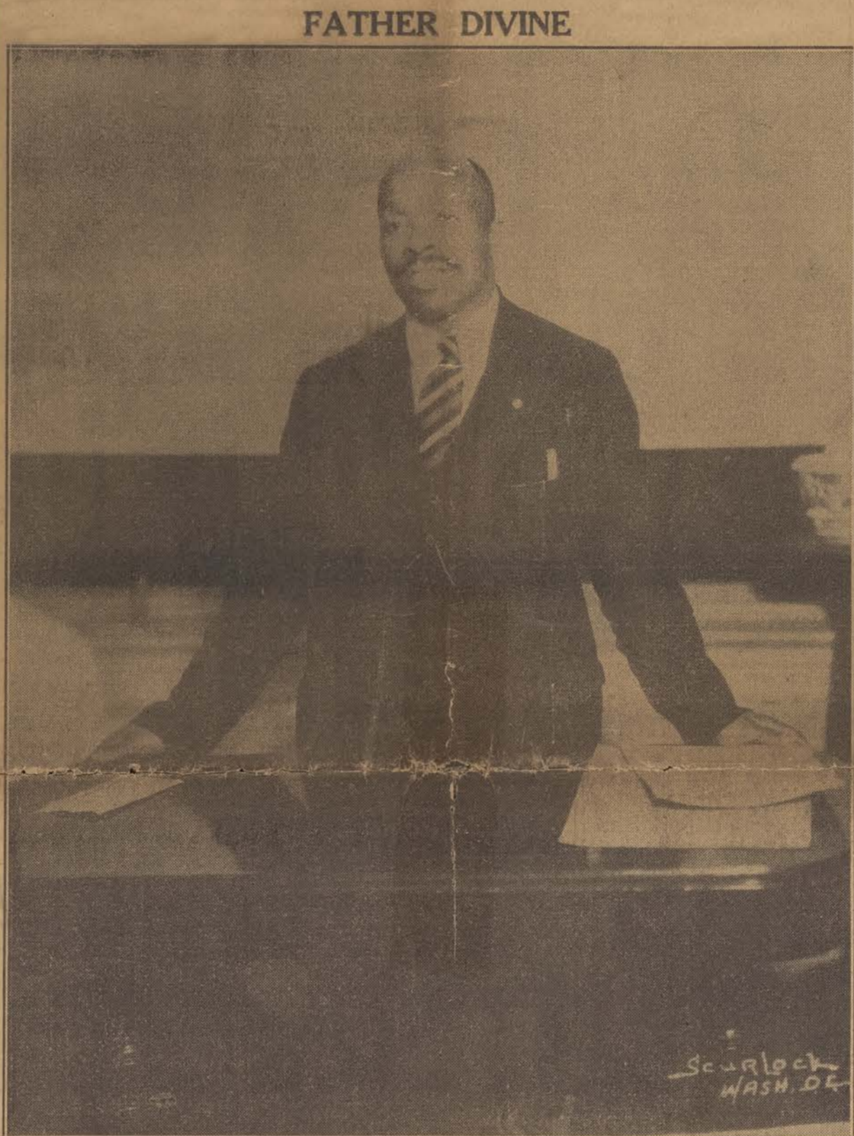
Personification of Fathership Degree of God

This burial in Baptism was but a slight sketch and a reflection of the whole of Christendom, when you are buried unto His Death, dying from the mortal version of things, and rising and walking in the newness of Life, putting off the old man with all of His deeds, all of your preconceived ideas and opinions, all of your human fancies, pleasures, and their tendencies, and recognizing God alone, as the Real, and the True, and the Living God. You are Resurrected into a new and a Living Way, verifying that of which the Apostle said, if you are buried with Him in Baptism in the likeness of His Death, you will also be in the likeness of