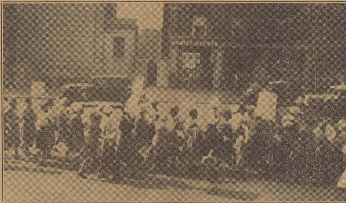
Children in Line of March of Parade in New York City on Easter Sunday