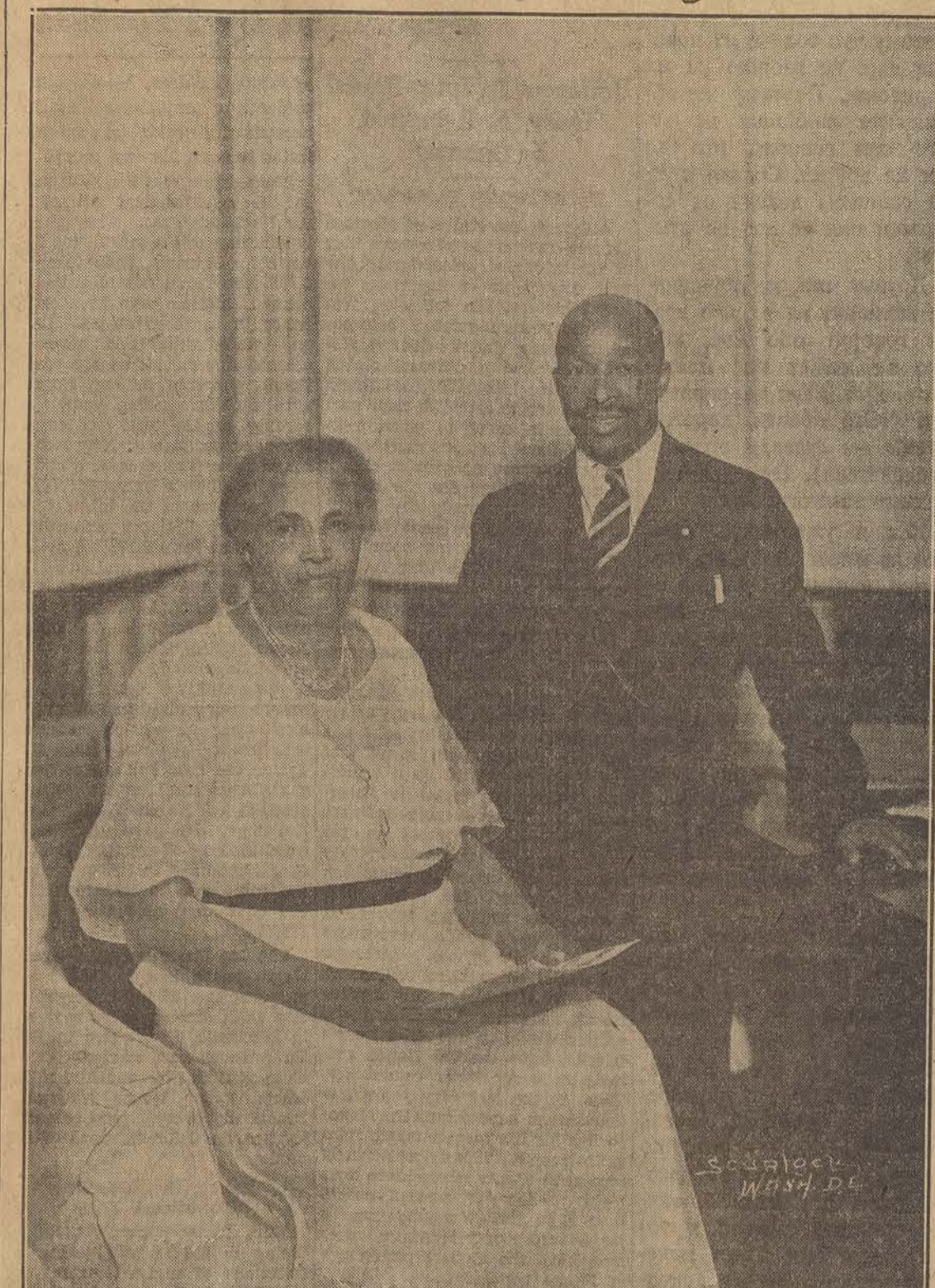
Mother and Father Divine! It Is Wonderful!

turns over adverse conditions, the Chi will, as He has ascended to the Father and vanished out of sight in expression, as a Person or as an Individual, called the Son, the Son-ship degree of expression was no longer seen when He did ascend to the Father, He vanished out of their sight, physically. He vanished out of their sights as a pre-evidence of the Son-ship degree of expression of the Highest Light of the Son-ship degree of Understanding, that would vanish out of the sight of the people and enter into the Father. It is Wonderful!