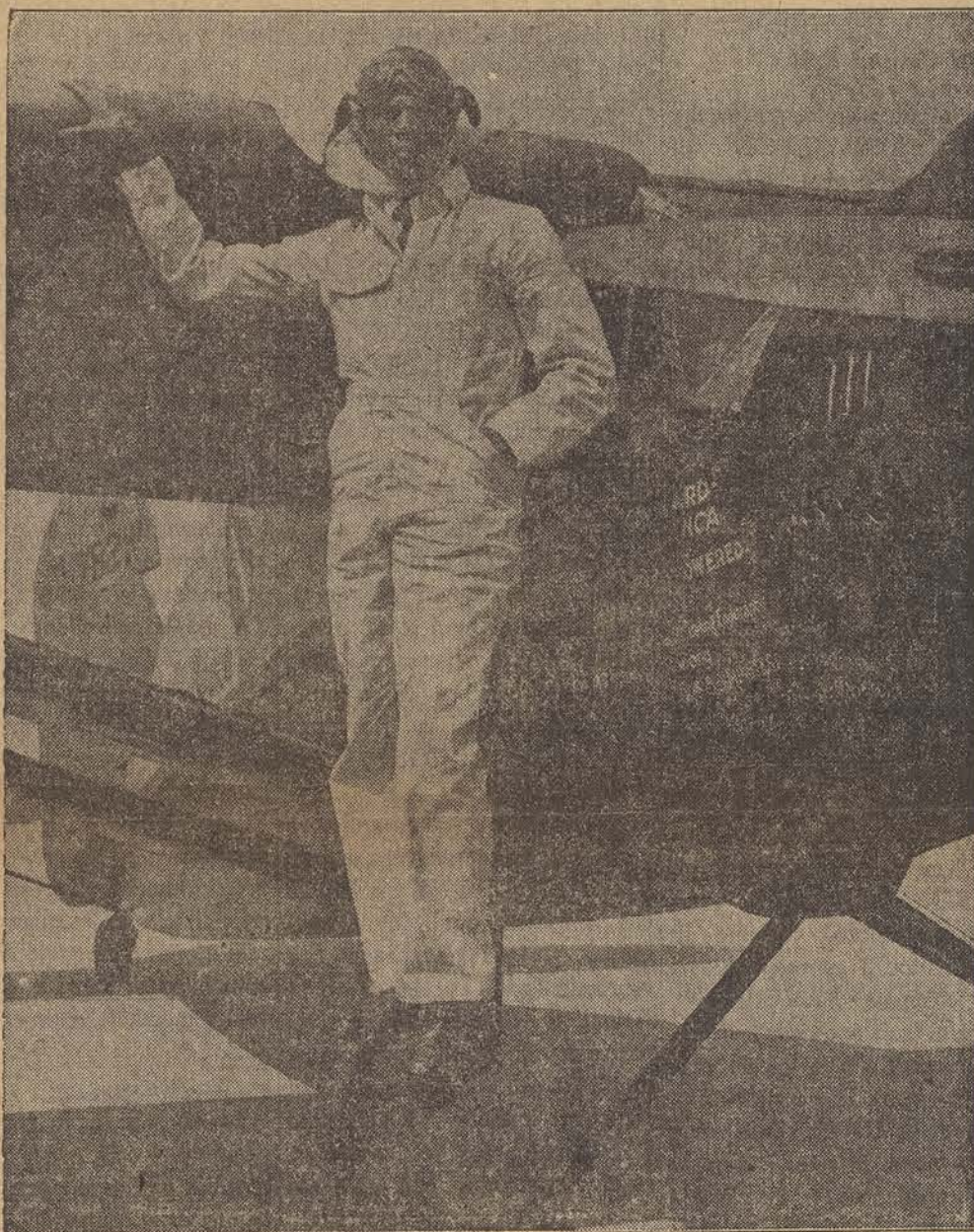
Colonel Hubert Julian, known as "The Black Ace," has made a pledge of service to Father Divine who christened the plane, Angelica, in which Colonel Julian will fly to Abyssinia in the near future.

soit déterminé d'être cet Esprit ou cette mentalité qui est appelé Jésus, Cela m'est égal. Il ne sera pas longtemps avant que le monde saura que ce Principe dont j'avance a été élu Roi des Rois et Seigneurs des Seigneurs. "C'est bien vous, Pere" vint de la foule.) C'est vraiment merveilleux! "Devant ce Nom il faut que chacun S'agenouille et que chacun confesse." C'est vraiment merveilleux! Avez-vous jamais vu ou entendu parler d'un homme aussi dévoué et courageux comme le present Maire de notre ville? C'est vraiment merveilleux! C'est expression fut et est la transmission identique de la mentalité de Celui dont vous dites que Je le suis, et comme Je l'ai dit Je le répète. "Vous Voici et Me Voila," Me voici assis et vous voila debout, le transmission de Dieu en homme et de l'homme à Dieu, ayant la domination, et l'expression en ceux et par ceux qui ont porté leurs corps assujettis. S'ils le font, ils seront des producteurs de Mon Esprit de même comme vous l'êtes. La transmission de Dieu à l'homme. C'est vraiment merveilleux! Dieu Se manifestant dans les affaires des hommes, se transmettant Lui-même à eux et leur donnant le vrai Pouvoir Officiel! Si vrai que Jésus, Le Grand Maître d'Amour aurait dit "Le Pouvoir vous serez donné après la reception de l'Esprit Saint.